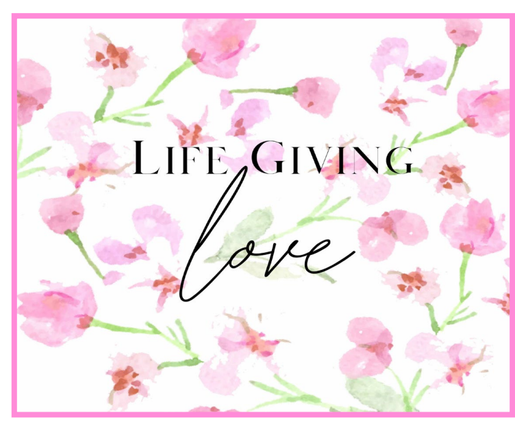
Baptist Children's Home and Family Services